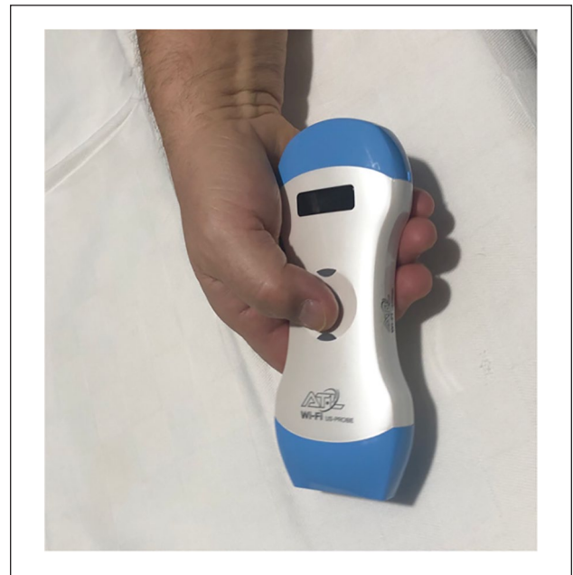
Figure 1. Wireless ultrasound probe.

Investigations are ongoing to assess whether POCUS can improve vessel cannulation compared to "blind" PE-based cannulation. However, to our knowledge, a direct comparison with specialized and extensive US