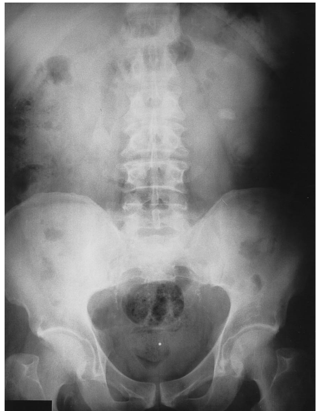
Fig. 1. Abdominal plain radiograph before ESWL, showing the calcium-containing stone in the left kidney. Bilateral vascular calcifications are also detectable.

A 61-year-old male patient was admitted because of chronic loin pain due to a kidney stone in the left renal pelvis. At 48 years of age type 2 diabetes mellitus was diagnosed and treated with oral anti-diabetic drugs for 3 years and then by insulin. Peripheral vascular disease was also reported. Two weeks before admission, the patient experienced left loin pain with gross haematuria. Sonography and plain radiography demonstrated a calcium stone in the left renal pelvis (Figure 1). Excretory urography confirmed the presence of a 18 mm diameter calcium-containing stone in the left