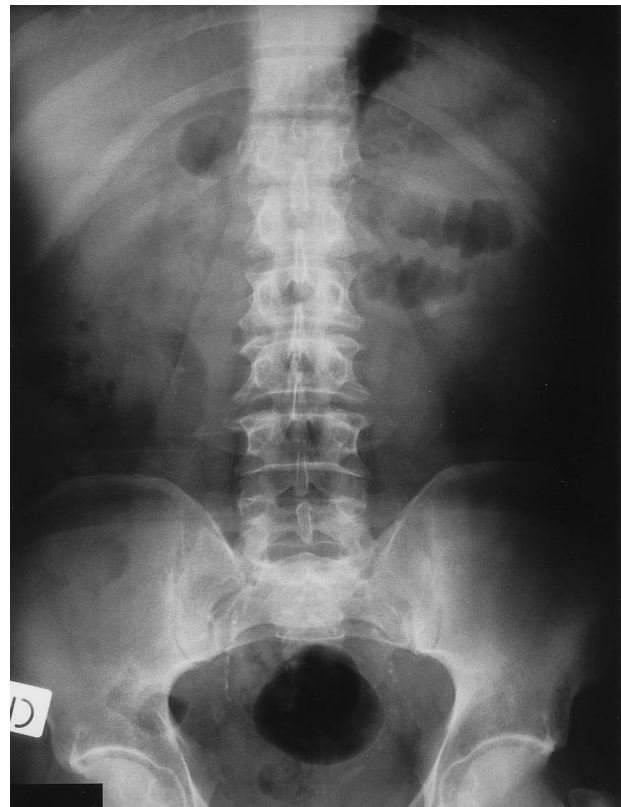
Fig. 3. Abdominal plain radiograph 3 weeks after ESWL treatment. The renal stone appears reduced in size, several small fragments are in the lower tract of the left ureter, no bowel distension or air-fluid levels are present.

This case describes a complication following ESWL treatment of a urinary tract stone. ESWL was