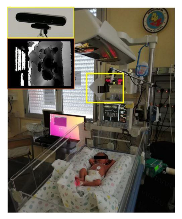
Fig. 1. Depth-image acquisition setup. The depth camera (yellow boxes) is positioned at 40cm over the infant's crib and does not hinder health-operator movements. An example of the acquired depth frame is showed on the top left corner (orange box).