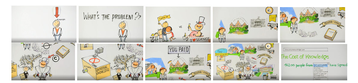
Figure A2: Video frames of the T_Activist Video

But, let's get back to data mining as a scientific publishers own the copyright to most of the knowledge contained in these Published before works, they consider how much access people get over their content. Including if you want to mine it, once you've paid for it. If you just want to read it with your eyes that's probably fine, but if you want to mind the data in this thing then, oh! well... Maybe we'll tell you which tools you can use, and it might cost you more to mine it than it would to read it, and that we might restrict how many pages that you can actually use algorithms on per-day. And maybe you can only read the text, and you can't look at the images and the charts. Honestly, complete control freaks! Now the EU copyright review urgently needs to curb this business of copyright that is smothering science. Copyright is a tool, not a goal! The goal is human knowledge and better access to this knowledge for everyone. In our next video, we'll talk about artists, industry, and copyright. The good, the bad, and the ugly. So subscribed, and don't miss out on the fun, and goodbye."